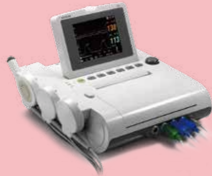
F3 Fetal Monitor